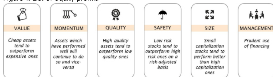
Figure 1: List of equity premia

This is just an illustration of how two premia that perform well in different market environments can generate a more stable return profile when combined. We believe that a far better result can be obtained by moderately expanding the number of risk premia. The key idea in end however is that by blending premia, one can produce a portfolio that may have at least a couple of performance engines switched on during every market environment. It is worth noting that blending premia causes complexity, and therefore multi-premia strategies greatly benefit from the intrinsic discipline and risk management capabilities of computerised systems that are developed and managed by quantitative market experts.